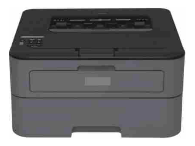
Fig. 8.4: Laser Printer

So, the sum of (47): 0010 1111 and (29): 0001 1101 = 0100 1100. Now try to convert binary 0100 1100 into decimal you will get 0 + 64 + 0 + 0 + 8 + 4 + 0 + 0 = 76.