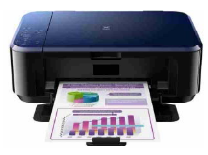
Fig. 8.3: Ink-Jet Printer

Ink—Jet printer is a non—impact printer that build a character or graphics shapes on the paper by sprinkling of liquid ink in the shape of tiny dots. The quality of print is far better than the print taken by a dot—matrix printer. Ink—jet printer has two cartridges, one of black ink and another of color ink. These cartridges have ink in liquid form.