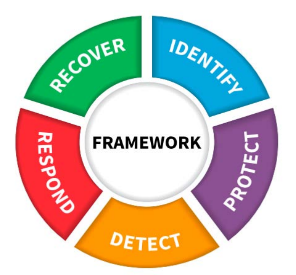
Figure 4.2 NIST Framework, Source: NIST Article: NIST.CSWP.04162018

The Framework Implementation Tiers assist organizations by providing context on how an organization views cybersecurity risk management. The Tiers guide organizations to consider the appropriate level of rigor for their cybersecurity program and are often used as a communication tool to discuss risk appetite, mission priority, and budget.